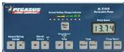
LCD DISPLAY FOR ALEXIS®