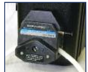
MASTERFLEX EASYLOAD™ 2 PUMP HEAD

Since peristaltic pumps apply a negative pressure to the water column, some people do not consider them suitable for collecting samples for VOC analysis.