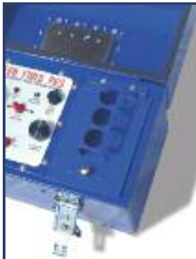
STAND FOR SAMPLE BOTTLES

W aterra introduces the Spectra Field-Pro — a state-of-the-art peristaltic pump that features a heavy-duty, all-inclusive design. This means no external cables, chargers or batteries to worry about.