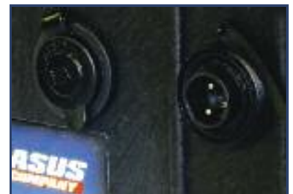
AC & DC POWER INPUT