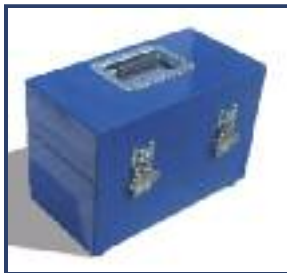
HEAVY DUTY CASE