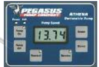
LCD DISPLAY FOR ATHENA®