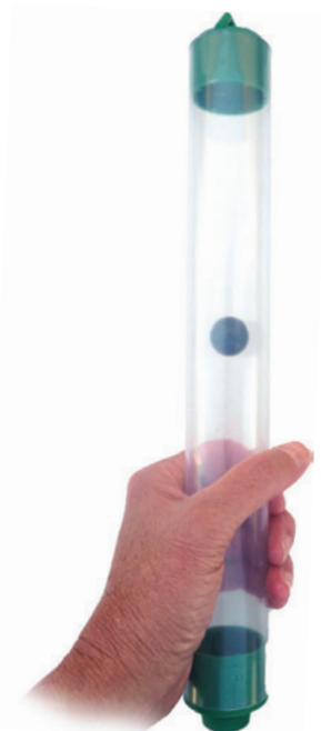
Model 428 BioBailer