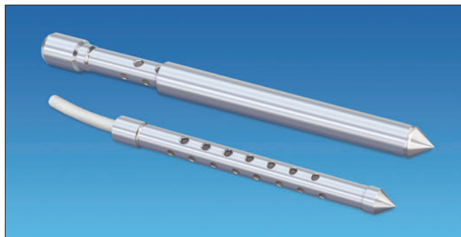
Model 615 Drive-Point and Shielded Drive-Point Piezometer