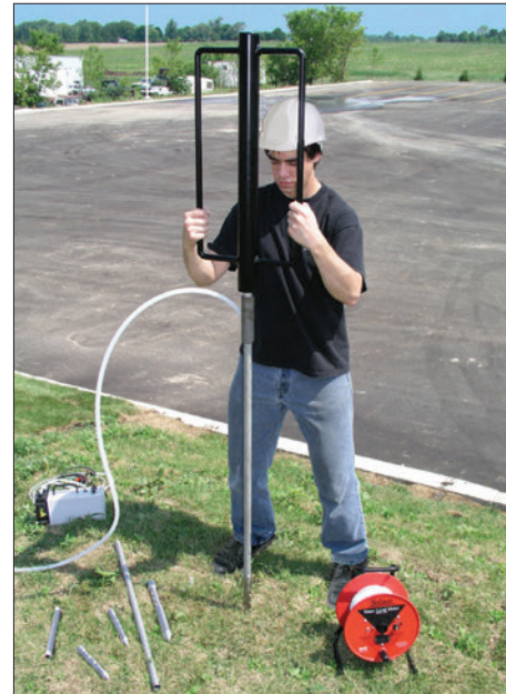
Installing Piezometers with a Manual Slide Hammer

Solinst Drive-Point Piezometers can be driven into the ground with any direct push or drilling technology, including the Manual Slide Hammer shown at right. To avoid clogging or smearing of the screen during installation, a shielded version is also available.